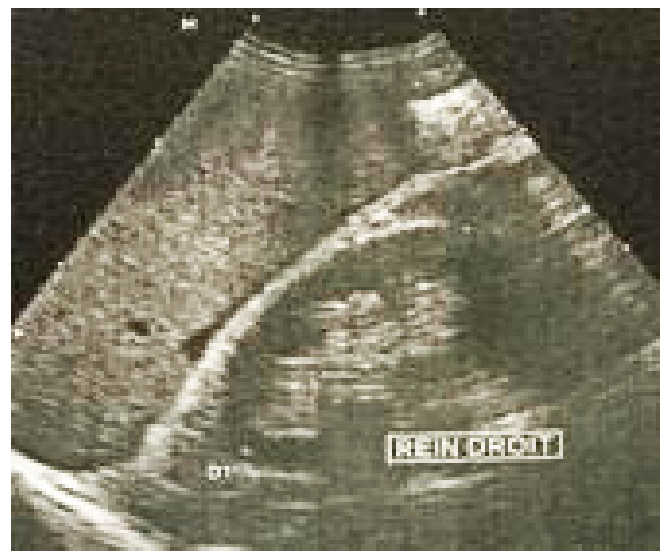
Figure 3b : Abdominal ultrasonography showing no ascites at 20 months with AlfapumpTM target volume at 0.600 liters/day.