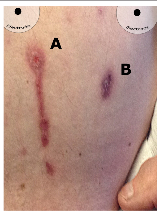
Figure 3 Case 2: Image of skin burns caused by ECG leads. Placement of the electrodes is indicated by the graphical overlay. The image is dated two weeks after the MRI scan and demonstrates two elongated burn lesions caused by heating (A & B) during healing which is consistent with the time of injury. The wounds are oriented in between the electrodes, which indicate trauma caused by the ECG leads instead of the ECG electrodes.

After the observation of the skin burns, Bayer HealthCare AG, Denmark (BHCD) and the Danish ECG electrode distributor, Ambu® were contacted. BHCD had a radiology service engineer perform a system service check and found the unit to be operating to specification. There was no evidence of product malfunction. The electrodes were also