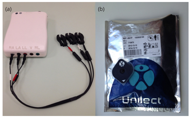
Figure 1 (a) Three lead electrocardiogram module box which is connected to a Medrad® Veris MR Monitor (Bayer HealthCare AG, Leverkusen, Germany). The leads are connected to the ECG box and the box is connected to the main monitoring unit using an optical cable; (b) The MRI conditional electrodes (Unilect™ 4841P ECG electrodes, Unomedical Ltd., Stonehouse, Great Britain).

The applied MRI scanner was a Siemens Skyra 3.0 Tesla (Software release VD11, Siemens Healthcare AG, Erlangen, Germany) using the standard Siemens 32 channel spine receive coil. The patients entered the scanner in the supine position with their heads first. In order to safely monitor the health of the patients during the scan, a Medrad® Veris MR Monitor with a concomitant three lead ECG system (Bayer HealthCare AG, Leverkusen, Germany) was used in conjunction with MRI conditional electrodes (UnilectTM 4841P ECG electrodes, Unomedical Ltd., Stonehouse, Great Britain). An image of the ECG box and electrodes can be seen in Figure 1.