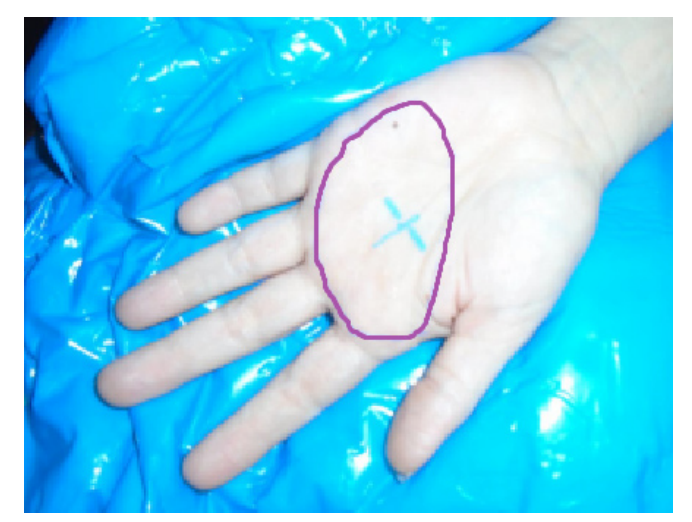
Figure 1 Hand set up in custom molded device.

disease and extension to the palmar skin above the target. CTV depth was measured as the perpendicular distance from the palmar skin to the deepest portion of the target. Hand thickness was measured at the epicenter of the CTV. The CTV was contoured in the Varian Eclipse<sup>M</sup> Treatment Planning System; then electron beam energy was chosen to provide adequate coverage of the CTV. Custom tissue equivalent bolus was placed on the palm with dosimetric goals of covering 100% of the CTV by the \geq 90% isodose line. A 10 x 10 cm cone was used with an 8 cm custom cutout. The posterior hand avoidance (PHA) was defined as the tissues posterior to the ventral aspect of the metacarpal bones since all nodules and cords were felt to be superficial to that border.