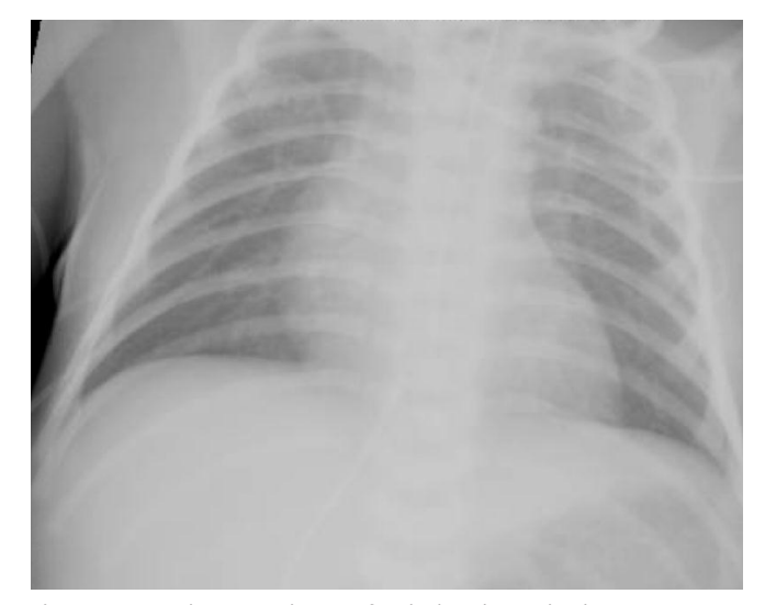
Figure 1 CXR without noted signs of air leak, enhanced online.

Neonatal chest radiographs that were performed on day 0 or day 1 of birth were included in the study (Figure 1). These chest radiographs were separately interpreted by two groups: 1. Two radiologists (pediatric radiology attending and diagnostic radiology PGY2 resident); 2. Two neonatologists (neonatology attending and PGY5 neonatology fellow). Both groups were blinded to patient clinical details, radiology reports, and the other group's interpretation. The chest radiograph was considered positive for pneumothorax if there was free air in the pleural space, sharp cardiac border or mediastinal stripe or hyperlucent peripheral space with absence of lung markings along with visualization of visceral pleura (Figure 2). We defined tension PTX as one that increased intrathoracic pressure and caused signs of hypotension, bradycardia, and hypoxemia; radiographically, the above signs may be present along with a shift of mediastinum to the contralateral side or depression of the hemidiaphragm. The chest radiograph was considered indeterminate when there was questionable sharp cardiac border and negative when the aforementioned signs were absent. Only the positive cases were included for statistical analysis.